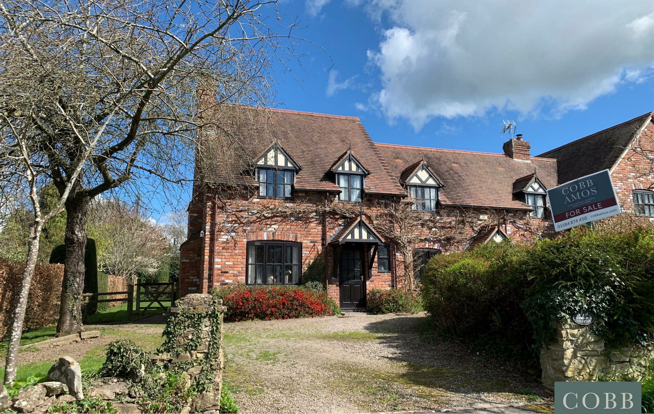
Grazers Cottage, Ashford Farm, Ludlow, SY8 4DB Offers Over £375,000